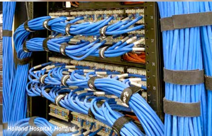
Holland Hospital, Holland