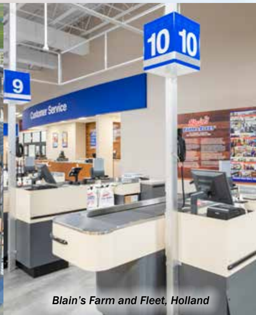
Blain's Farm and Fleet, Holland