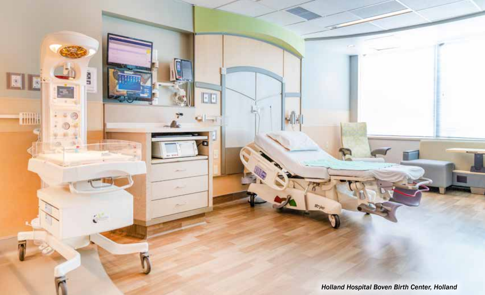
Holland Hospital Boven Birth Center, Holland