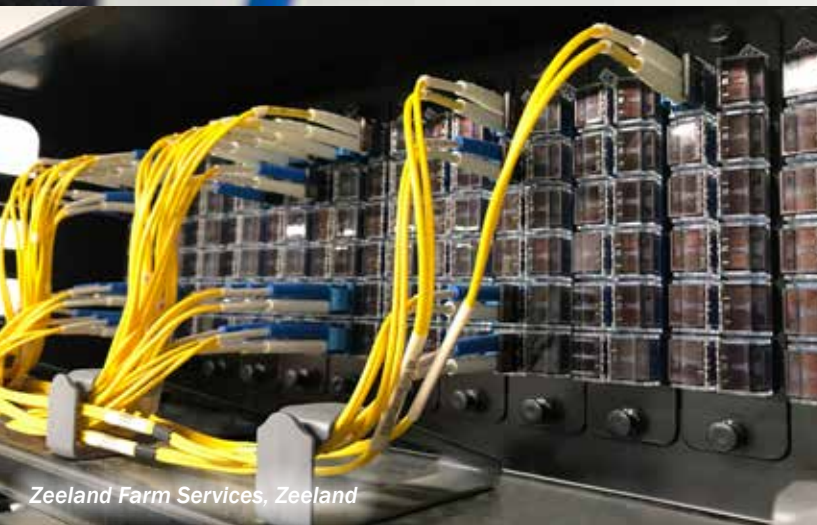
Zeeland Farm Services, Zeeland