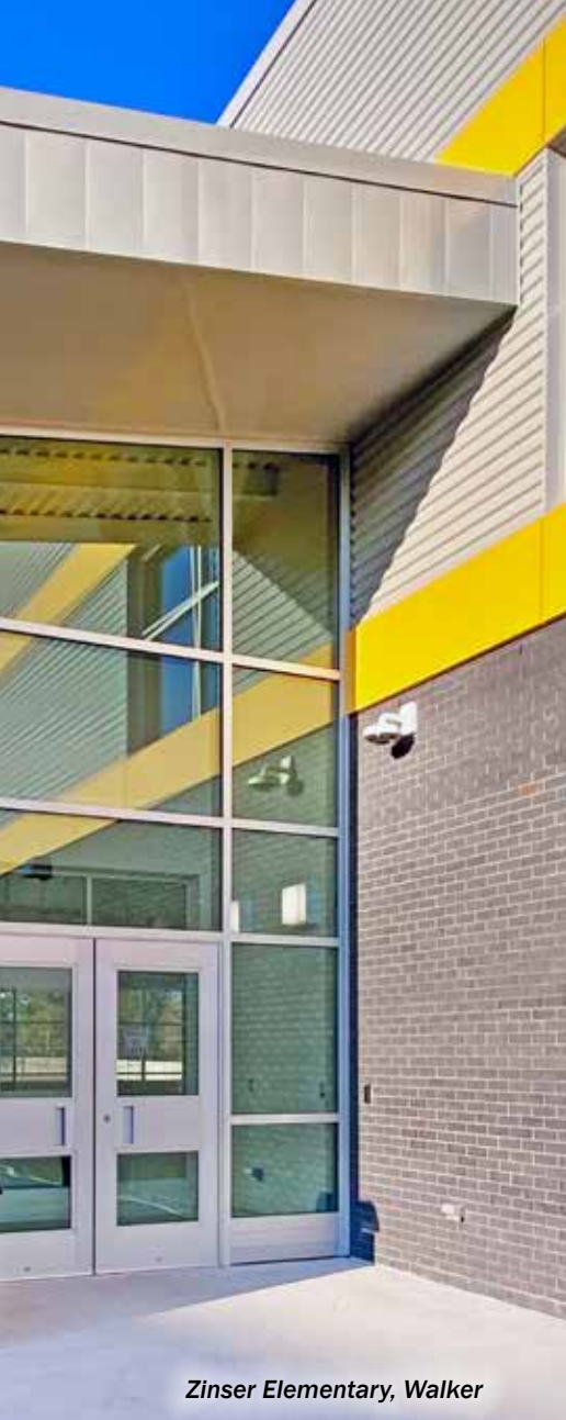
Zinser Elementary, Walker