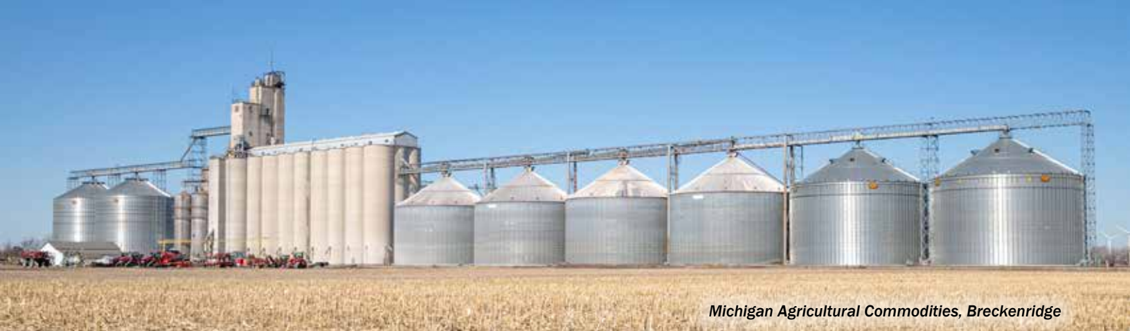
Michigan Agricultural Commodities, Breckenridge