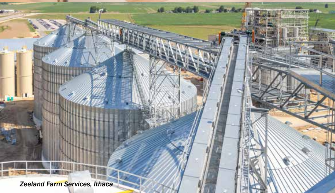
Zeeland Farm Services, Ithaca