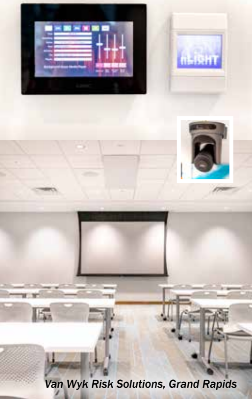
Van Wyk Risk Solutions, Grand Rapids