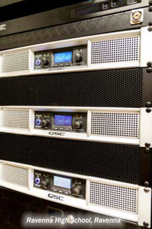
Ravenna High School, Ravenna